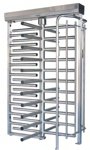
TITAN 4 SINGLE