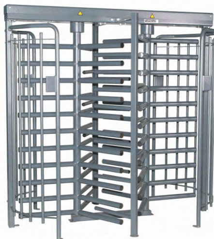
TITAN 3 DOUBLE