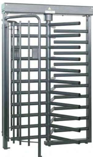
TITAN 3 SINGLE